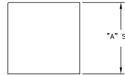
BODY DETAIL -L OPTION: LOCATE EZ-1L1-XX IN 4 OUTER CORNERS OF BODY IN THE SAME ROW